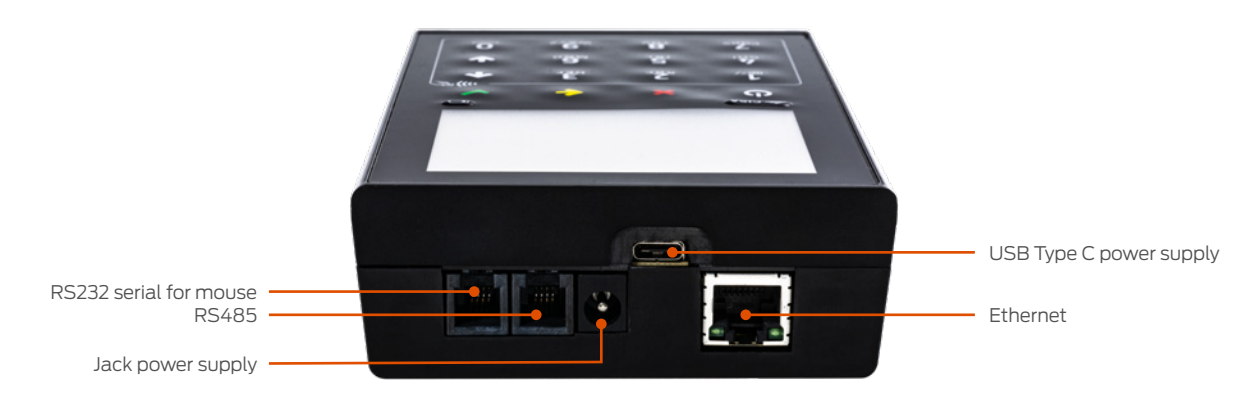
The eSIGNO mouse for NFC connection to locks is sold separately